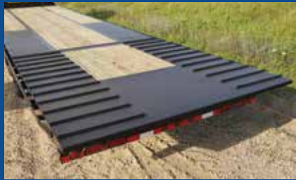
OUTER CLEATS ON DOVE