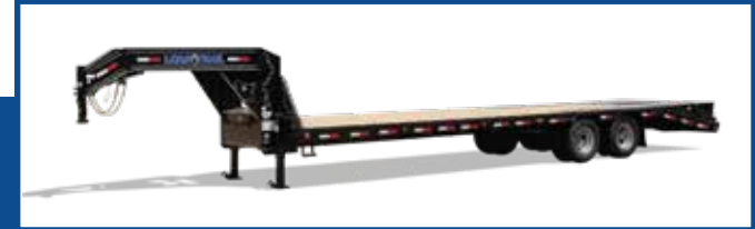
THE GP SERIES