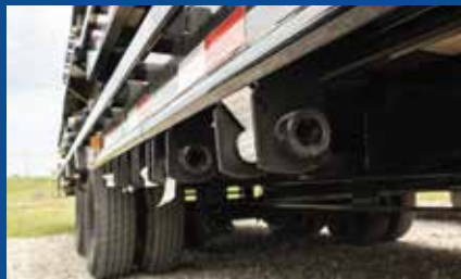
RATCHETS W/SLIDE TRACK