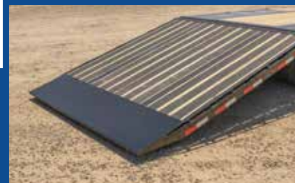
BLACKWOOD ON DOVE