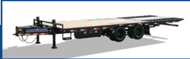
THE PL SERIES