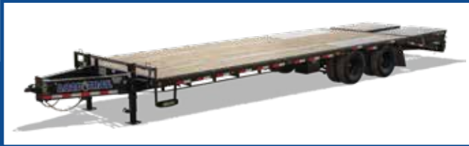
THE PP SERIES

Load Trail offers an affordable and versatile lineup of Low-Pro Deckover trailers. Available in bumper-pull and gooseneck configurations, Load Trail also offers a diverse lineup of customizations designed to meet any and every hauler's needs. The heavy-duty construction of the Low-Pro Deckover series ensures maximum performance and longevity, giving you piece-of-mind that the work will get done, and it will get done right.