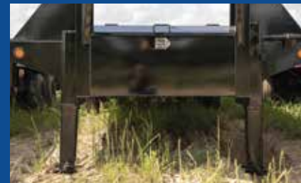
25K DROP-LEG JACKS