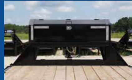
TOP RISER TOOLBOX