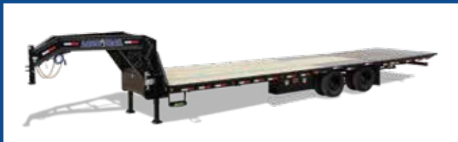
THE GL SERIES