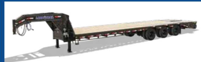
THE HH SERIES