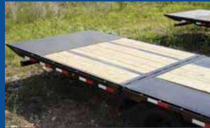
10FT HYD. DOVE