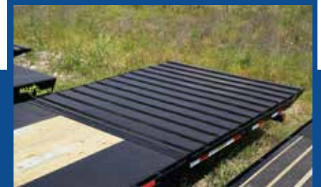
STEEL DOVE W/CLEATS