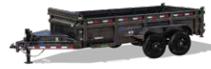
THE DL SERIES