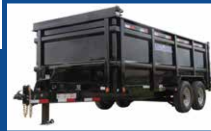
48" TALL SIDES