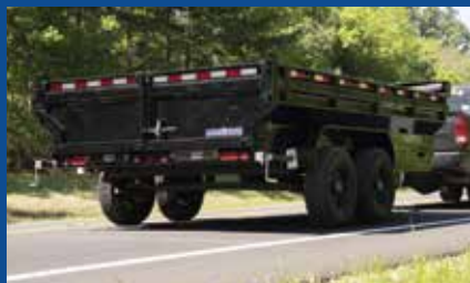
MAX-BED (flared sides)