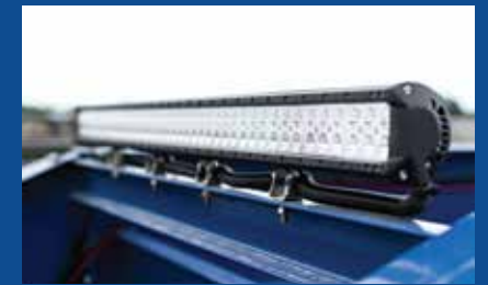
LED LIGHT BAR