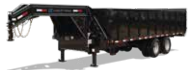
THE GX SERIES