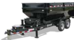
THE DM SERIES