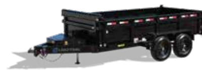
THE DT SERIES