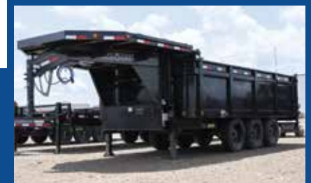
36" TALL SIDES