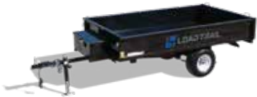
THE DU SERIES

You need a durable, high-quality dump trailer to get the job done. Load Trail offers one of the largest dump trailer selections in the industry. From the single-axle DU series to the massive GX deckover dump series and everything inbetween, we've got you covered. Load Trail's versatile dump trailer lineup gives you the advantage you need to power through the toughest jobs to get them done and to get them done right. Customize your next Load Trail by taking advantage our large selection of dump trailer options.