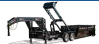
THE GM SERIES