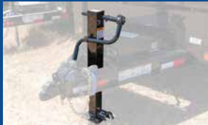
10K DROP-LEG JACK