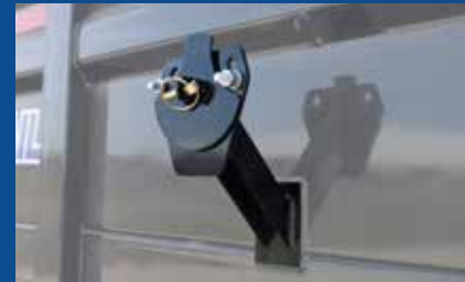
SPARE TIRE MOUNT