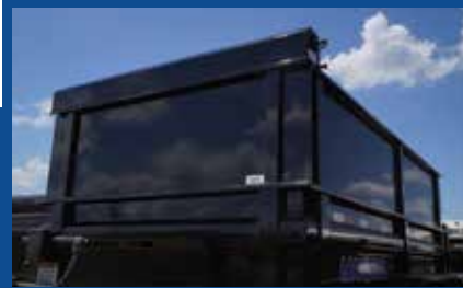
SOLID METAL EXTENSIONS