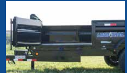
50" SIDE DOOR