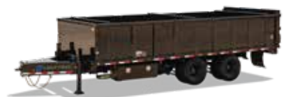
THE PX SERIES