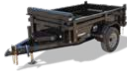
THE DS SERIES