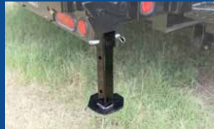
REAR SUPPORT STANDS