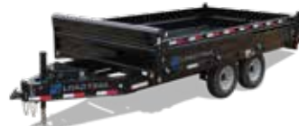
THE DZ SERIES