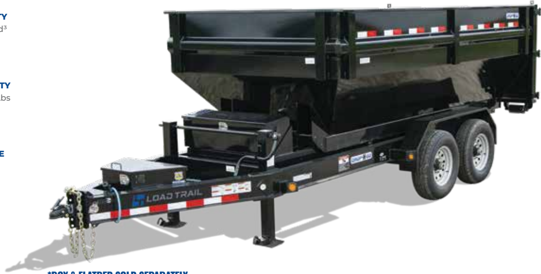
*BOX & FLATBED SOLD SEPARATELY