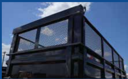
EXP. METAL EXTENSIONS