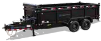
THE DH SERIES