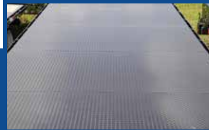
1/8" STEEL DP FLOOR