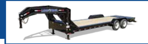
THE EG SERIES