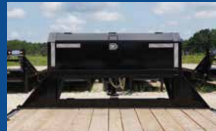
TOP RISER TOOLBOX