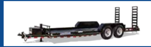
THE BC SERIES