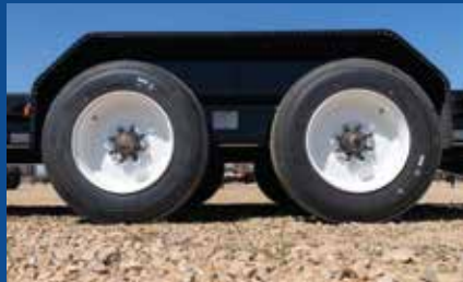
ST215/75 R17.5 W&T