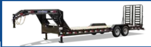
THE GC SERIES