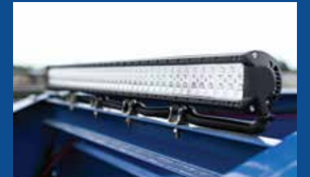
LED LIGHT BAR