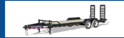
THE EH SERIES