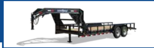
THE GF SERIES