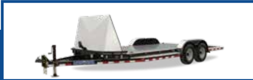
THE CZ SERIES