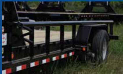
3" PIPE-TOP SIDE RAILS