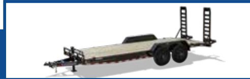
THE CH SERIES