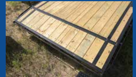
2' DOVE TAIL