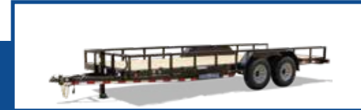
THE CS SERIES