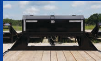
TOP RISER TOOLBOX