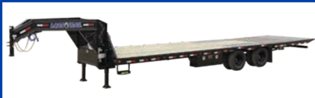
THE GL SERIES