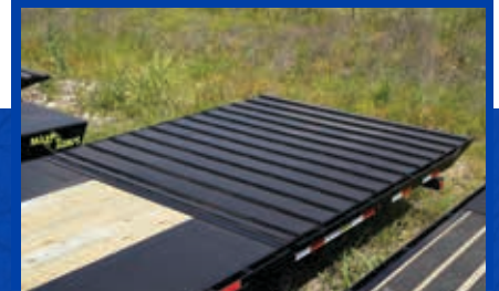
STEEL DOVE W/CLEATS