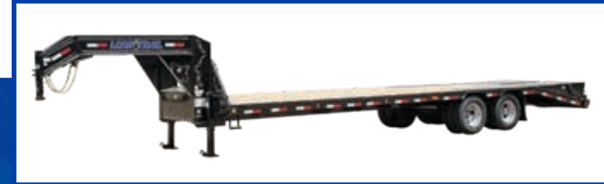
THE GP SERIES