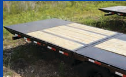
10FT HYD. DOVE