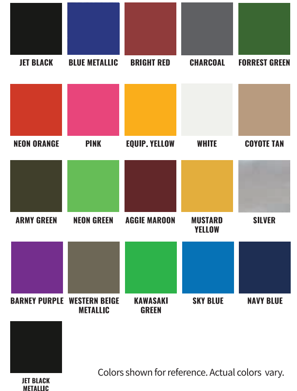
Colors shown for reference. Actual colors vary.

In the final step our trailers enter the oven to go through the curing process at the manufacturer's recommended temperature until fully cured. Our Powdura One-Cure primer/topcoat system is an innovative single cure primer and topcoat system. Our coating system co-reacts and cross-links to form a single highly corrosion resistant coating without the need to gel or cure the primer, eliminating any potential adhesion issues when trying to coat two step systems together. This product will help extend the life of your coating and ensure your trailer is protected for the long haul.