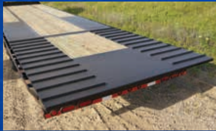
OUTER CLEATS ON DOVE