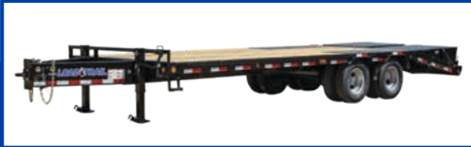
THE PP SERIES

Load Trail offers an affordable and versatile lineup of Low-Pro Deckover trailers. Available in bumper-pull and gooseneck configurations, Load Trail also offers a diverse lineup of customizations designed to meet any and every hauler's needs. The heavy-duty construction of the Low-Pro Deckover series ensures maximum performance and longevity, giving you piece-of-mind that the work will get done, and it will get done right.