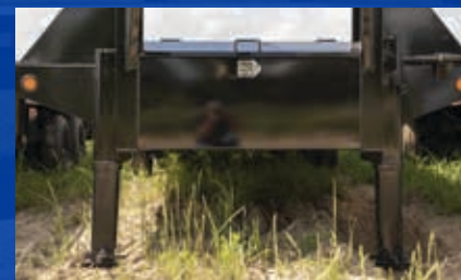
25K DROP-LEG JACKS