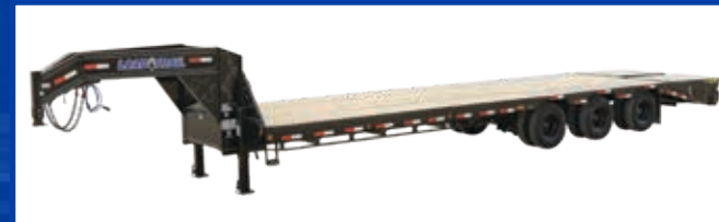
THE HH SERIES