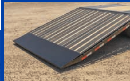
BLACKWOOD ON DOVE