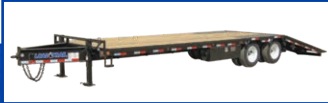
THE PL SERIES