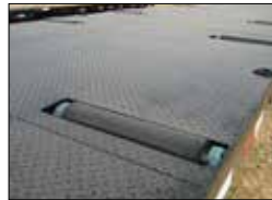
18" IN-FLOOR ROLLERS AVAILABLE