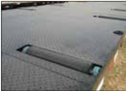
18" IN-FLOOR ROLLERS AVAILABLE