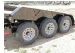
TRIPLE AXLE AVAILABLE