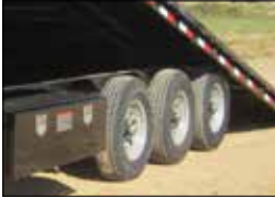
TRIPLE AXLE AVAILABLE