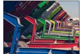
17 COLORS AVAILABLE