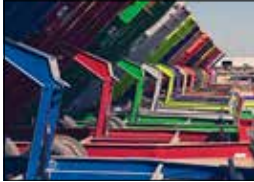
17 COLORS AVAILABLE