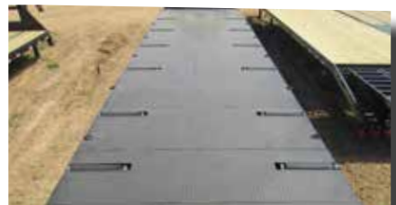
18" In-Floor Rollers