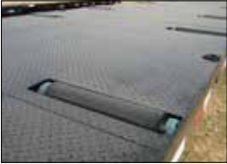
18" IN-FLOOR ROLLERS AVAILABLE