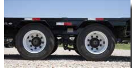
ST215/75 R17.5 Wheels&Tires