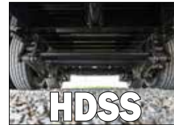
STANDARD ON ALL TANDEM & TRIPLE, DUAL WHEEL CONFIGURATIONS