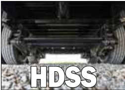
STANDARD ON ALL TANDEM & TRIPLE, DUAL WHEEL CONFIGURATIONS