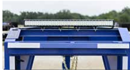
LED Light Bar