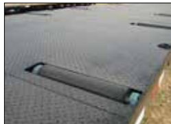
18" IN-FLOOR ROLLERS AVAILABLE