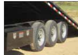
TRIPLE AXLE AVAILABLE