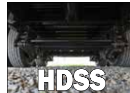
STANDARD ON ALL TANDEM & TRIPLE, DUAL WHEEL CONFIGURATIONS