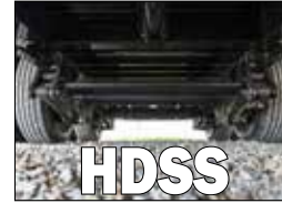
STANDARD ON ALL TANDEM & TRIPLE, DUAL WHEEL CONFIGURATIONS