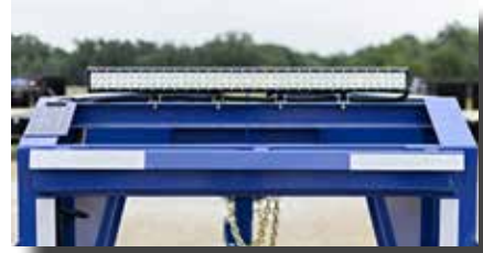
LED Light Bar