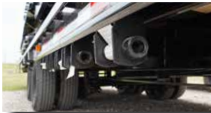
Slide Track / Ratchets