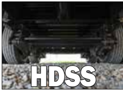
STANDARD ON ALL TANDEM & TRIPLE, DUAL WHEEL CONFIGURATIONS