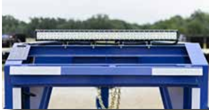
LED Light Bar