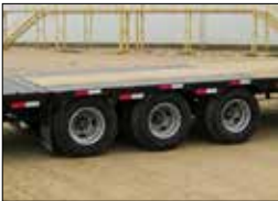
TRIPLE AXLE AVAILABLE