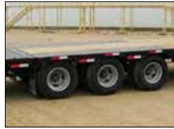
TRIPLE AXLE AVAILABLE