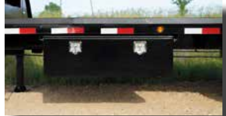
Side-mount Tool Box