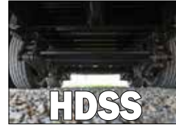
STANDARD ON ALL TANDEM & TRIPLE, DUAL WHEEL CONFIGURATIONS