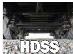
STANDARD ON ALL TANDEM & TRIPLE, DUAL WHEEL CONFIGURATIONS