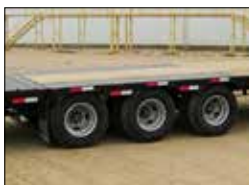
TRIPLE AXLE AVAILABLE