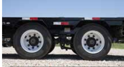
ST215/75 R17.5 Wheels&Tires