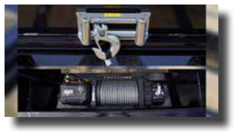
Winch/Winch Plate Combo